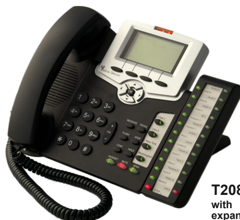
T208s with expansion module